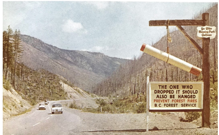
Coast Publishing Company c. 1958